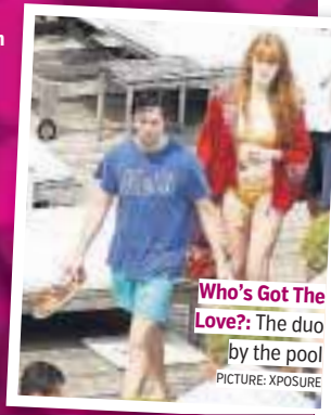
Who's Got The Love?: The duo by the pool