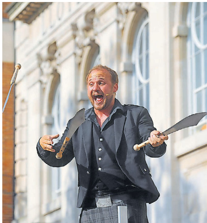
■ Evening street entertainment for visitors to Norwich city centre last year.

make Thursday evenings in Norwich the place to be.