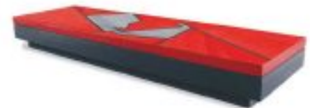
Ivar London: super-stylish storage solutions for your favourite wrist candy

GOOD DESIGN comes in all forms, whether it's the clean functionality of an Eames chair or the lavish detailing on a jewellery watch. It's something cool homeware brand Ivar London have long realised, and their commitment to impeccable design is reflected in the beautiful homes they create, with their design service and products for men hitting the nail right on the head. Their race track collection of watch boxes pays tribute to an iconic symbol of car racing design - the race tracks themselves. The smooth outlines and sharp curves are reflected in the Monza, Monaco, Silverstone and Abu Dhabi watch boxes, which trace the silhouettes of famous tracks in vividly-coloured lacquer veneers. Luxury details, including under-box LED lighting, the tray-style soft interior and high quality hinges, mean these accessory boxes aren't just storage, but desirable objet d'art in their own right.