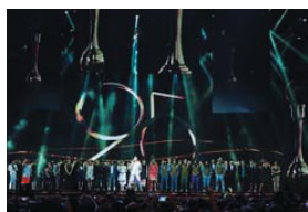
The 25th Golden Melody Awards nominees

'The other problems revolved around how best to install a sound system in a venue like the Taipei Arena,' he continued. 'The system built was a standard rock and roll setup, and I believe they hired in