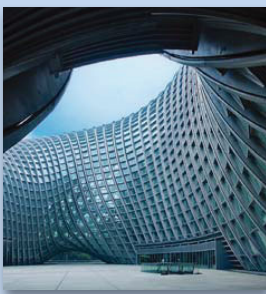
Phoenix TV's Beijing facility

The facilities in the Chinese capital comprise a 600 sq-m