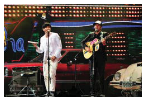
Jason Mraz on stage at the show