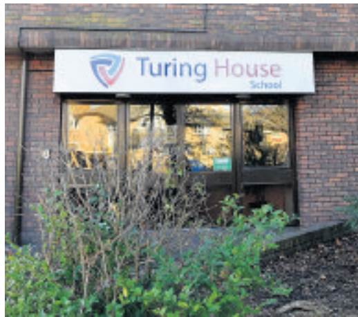
Debate: Council members are calling for Turing House School to accept an equal proportion of pupils from Whittton when its planned move is completed